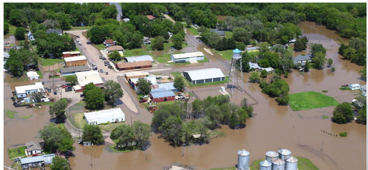
Flooding of Tescott, Kansas

We spend a lot of our planning efforts in Kansas focused on drought, and rightfully so. This flood has however, shown there is a need to revisit our flood management as well. Most of our flood infrastructure was built between the 1950s and early 1980s. It’s still working well, but in some instances, is showing its age. In some areas we have also seen where flood protection is probably not what it should be. Flooding will return, perhaps more frequently than we have currently been planning for. The question is whether we will be more prepared for the next one.