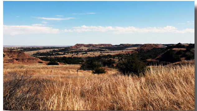
Gypsum Hills, Medicine Lodge, Kansas

Precipitation: Yearly average of 22-37 inches W-E