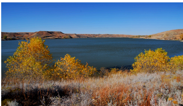
Clark County State Lake, Clark County, Kansas

A pilot project in 2017-18 will look at treatment of produced water for reuse. This is an early step in reducing fresh water use and could be an additional supply for this region.