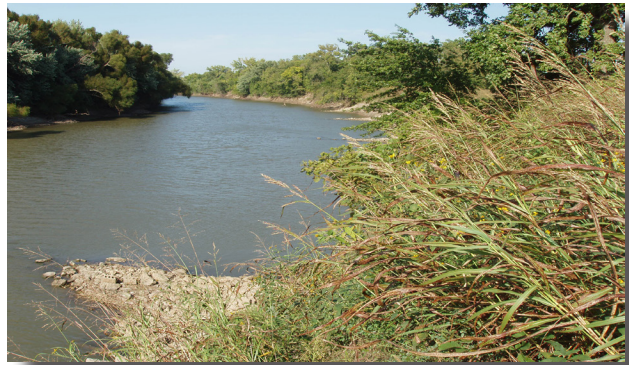
Neosho River, Streambank Stabilization Site

Prolonging water supply in John Redmond Reservoir through sedimentation reduction. Practices such as no-till, cover crops, filter strips and streambank stabilization, along with education efforts, are important in achieving this goal. Studies of reducing Marion Reservoir’s algal bloom frequency will be done.