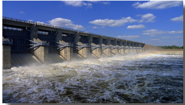
John Redmond Reservoir, Coffey County, Kansas

Precipitation: Yearly average of 30-42 inches W-SE