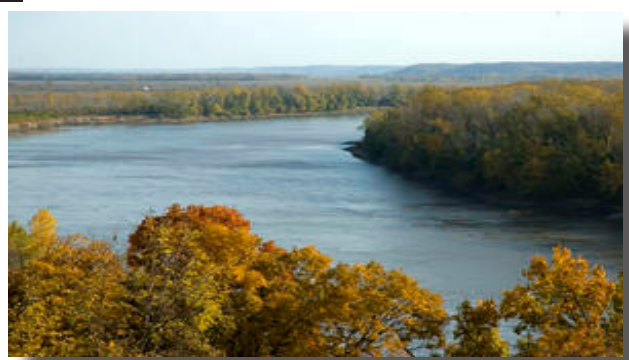
Missouri River, Leavenworth County, Kansas

Precipitation: Yearly average of 38 inches