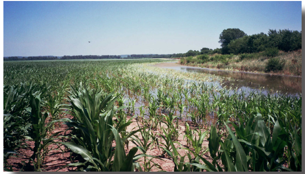
Dalbey Bottoms, Atchison County, Kansas

Accurate assessment of the quality and quantity of available groundwater and determination of safe yields to assure future water availability. Much of the groundwater in the Missouri Region is in unconnected glacial aquifers and difficult to access for the entire region.