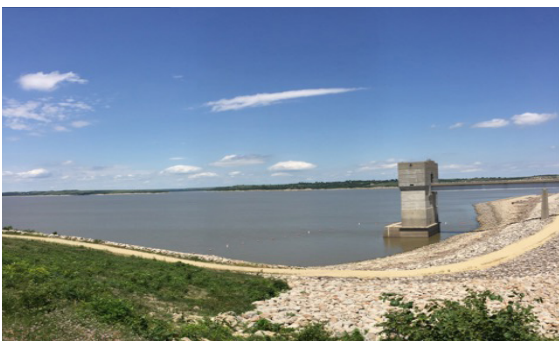
Tuttle Creek Lake, Riley County, Kansas

The Kansas RAC focuses on reservoir sedimentation and harmful algal blooms. We proposed a model, the Kansas Basin Watershed Management System, to streamline the process and increase coordination among agencies. The goal is a single science-based, watershed prioritization system leveraging existing programs to selectively target and fund projects.