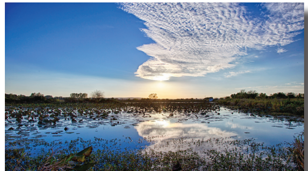
Baker Wetlands, Douglas County, Kansas