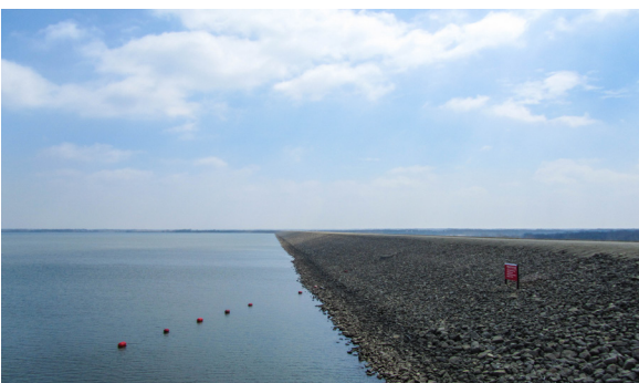
El Dorado Lake, Butler County, Kansas

Achieve and maintain sustainable balance of groundwater withdrawals with annual recharge by 2020; Implement and maintain watershed protection activities to maintain regional reservoir storage capacity for an additional 100 years; and develop a plan to manage and mitigate areas of groundwater contamination.