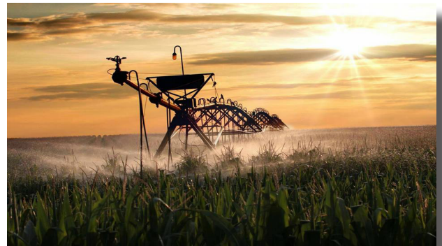
Irrigation from Equus Beds Aquifer in McPherson County, Kansas

Precipitation: Yearly average of 28-33 inches NW-SE